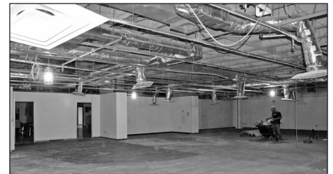
The former dance space on the second floor will soon be home to a college and career readiness space.