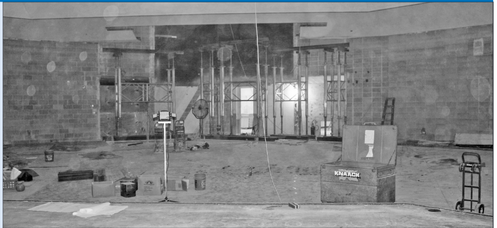
Clockwise from above, the former auditorium is being converted into a large meeting space.