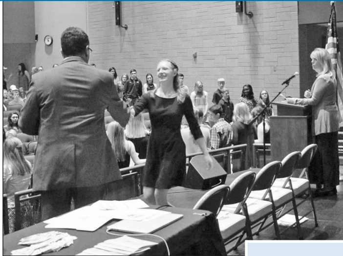
Teachers, family, and friends cheered on Simley's newest members of the National Honor Society during a celebration last spring in the Performing Arts Center.