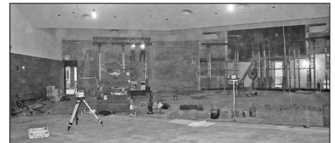
When completed, the meeting space will be available to students, staff, and community groups.

Other projects include a new school store, new copy center, and new bathrooms off the former commons area, which itself will also be re-done.