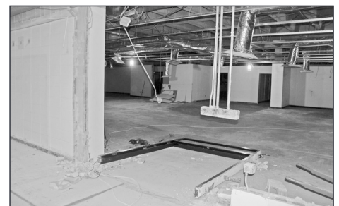
The college and career readiness space will allow students to explore post-secondary options and to meet with college and military recruiters.

If you're looking for a job that provides a few extra hours each week with flexible scheduling, the Inver Grove Heights Community Schools has plenty of fantastic opportunities!